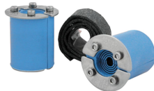
RS PPS seal